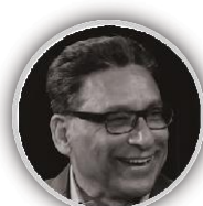
Vinod Dham Father of Pentium Chip