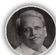
Kris Gopalakrishnan Co-founder - Infosys